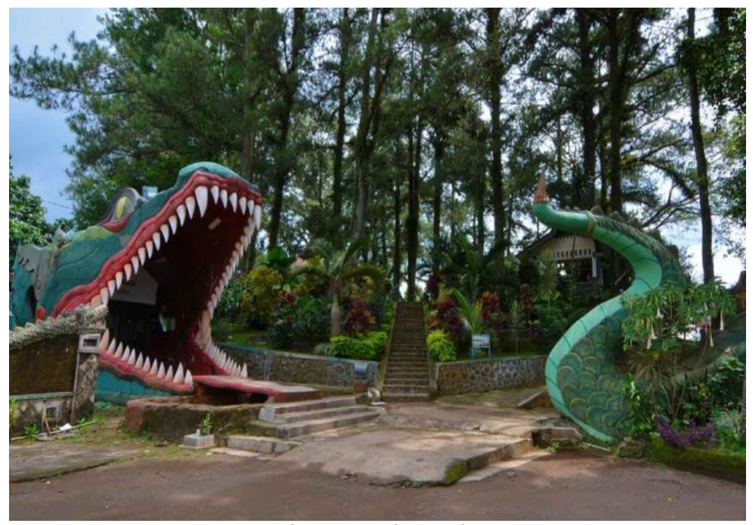
Figure 3 . Open space photos 2019 (before the Covid-19 Pandemic)

In short, public open space has three important characters: there is a meaning (meaningful), can accommodate the needs of each user in carrying out activities (responsive), and can accept various community activities without discrimination (democratic) (Lesil, 2016).