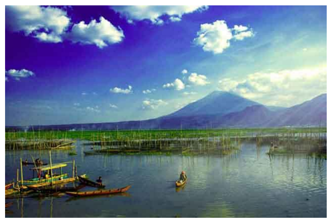
Figure 1 . Lake Rawa Pening in 2019 (before the Covid-19 pandemic)

The RTRW of Semarang Regency is still managing zones in general, still using a map scale of 1:250,000. Detailed Spatial Planning (RDTR) and Building and Environmental Planning (RTBL) with a more detailed scale, are not yet available. Based on this, a more detailed spatial or zoning plan must be made immediately and not forgetting the open space area, both green and non-green as a potential for the development of nature-based tourist destinations.