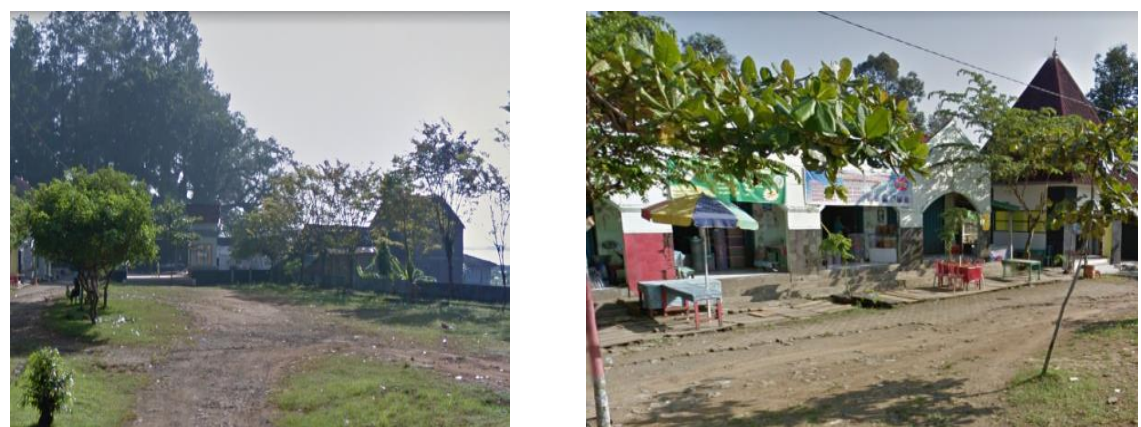
(Source: Google Maps, 2019) Figure 2. Streets and buildings 2019 (before the Covid-19 pandemic)

Based on the survey results, this area is still natural and there is no arrangement regarding building arrangements such as the distribution of building blocks in the area, let alone plots. Currently, there are only vast expanses of rice fields, plantations and swamps. In some parts of the area, there is already a road network made by the Department of Highways of Semarang Regency.